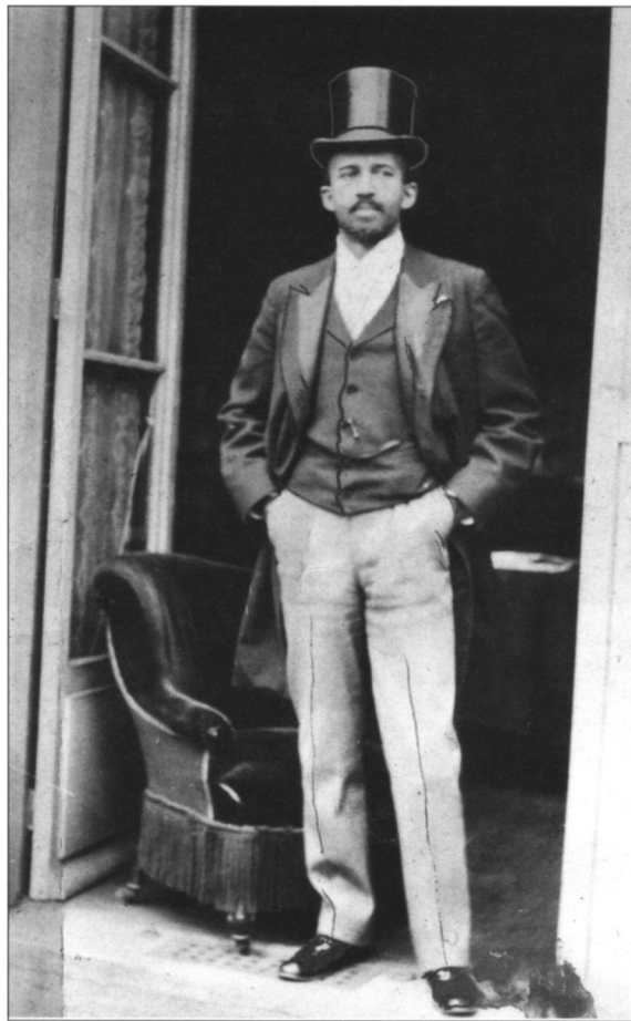
W.E.B. Du Bois at the Paris Exposition, 1900

Given Du Bois' vision of higher education and increasing militancy, we might interpret Washington's silence as ideologically driven. He could not risk the ire of local whites and Tuskegee donors who might object to the haughty sociologist. But Washington's hesitation may have stemmed not from clashes of ideas but from his recent dealings with Du Bois. He had already sent Du Bois two job offers, and both were rejected. Du Bois himself had solicited the second