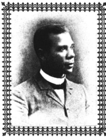
Booker T. Washington